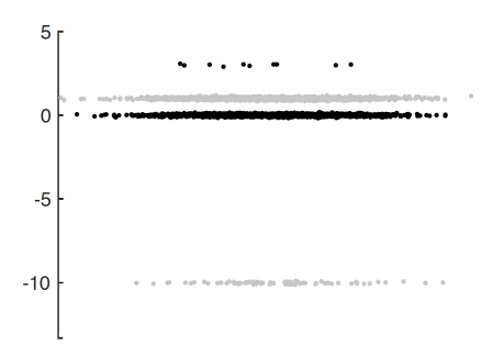
Fig. 1 An illustrative distribution of data. Positive observations are gray and negative observations are black. Solution 1 ranks observations from top to bottom, and Solution 2 ranks solutions from bottom to top.

Another way to say this is that the convexification "washes out" the differences between rank statistics. If we were directly to optimize the rank statistic of interest, the problem discussed above would vanish.